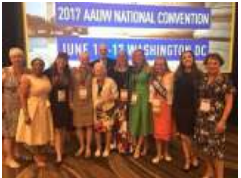
Jefferson County NY during AAUW National Convention.

At convention we attended workshops on programming, membership, legislation, creating inclusive spaces, Women and Student Debt, Communication Skills and other topics. There were many distinguished speakers including Judy Woodruff, Co-anchor and Managing Editor PBS NewsHour, and Supreme Court Associate Justice Sonia